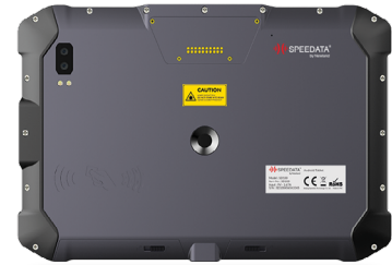
backside of the SD100